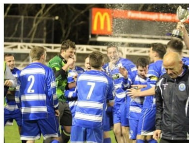
Epsom & Ewell FC, Cup Winners 2012/13