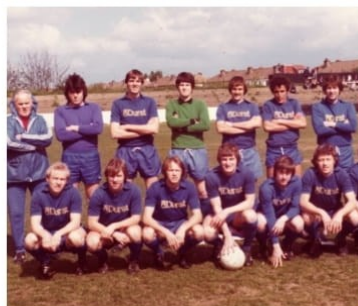
Epsom & Ewell FC, Team Photo 1961

war, Epsom F.C. restarted, continuing in the London League and reclaimed West Street.